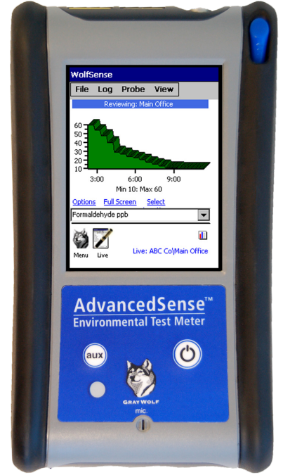
Display real-time HCHO graphs, attach text/audio notes and access many other powerful features when interfaced to AdvancedSense, WolfPack or DirectSense WIN7 notebooks/tablets

Provided with GrayWolf's versatile WolfSense™ PC data transfer and reporting software. Download readings stored on the FM-801 base unit when used as a stand-alone, or when optionally interfaced to compatible GrayWolf platforms