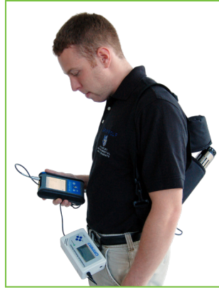
FM-801 (on optional ACC-BELTCL-I belt clip) shown connected to GrayWolf AdvancedSense™