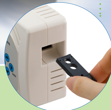
Detachable Sensor Cartridge