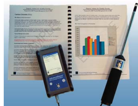
WolfSense ARG report

WolfSense PC software allows logged data to be down-loaded to your PC for review, graph generation, cut & paste reporting and/or simple export to Excel